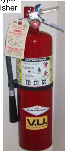
“ABC” type extinguisher

VU Residence Halls have combination “ABC” extinguishers that can extinguish most fires.